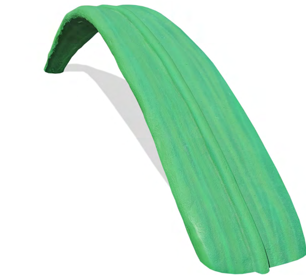
3 Grass Blade Beam_SC020